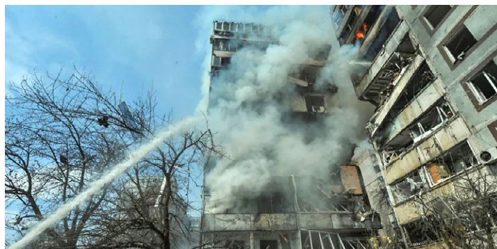
Odessa, Ukraine - where our staff serve