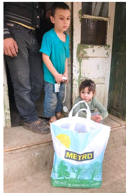
Christmas baskets delivered