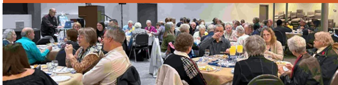
Friends of IM Fundraiser

Tickets cost $30.00. Buy tickets here: www.im-canada.ca/event/foim